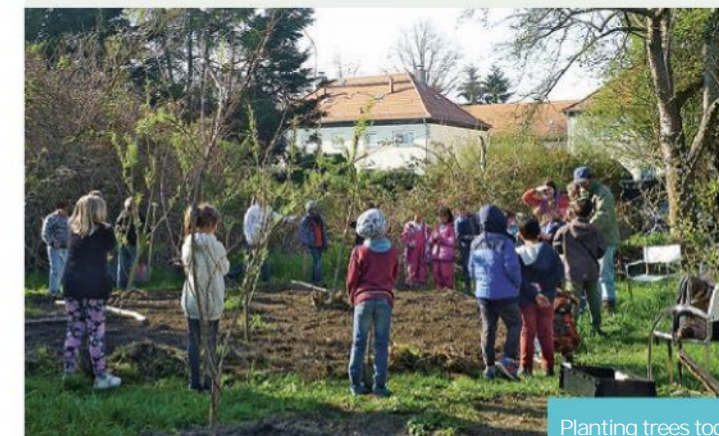
Planting trees together not only makes sense, it brings joy too

The community hut is decorated with yellow frangipani decor from recycled PET bottles