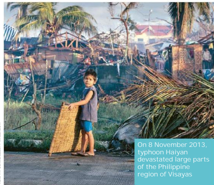
On 8 November 2013, typhoon Haiyan devastated large parts of the Philippine region of Visayas

The catastrophic flooding that hit western Germany last summer showed us in the starkest terms that the climate crisis has arrived here too. If we are to limit the climate crisis to a manageable level, the coming years are going to be decisive. We should use this challenge as an opportunity to create a fairer world.