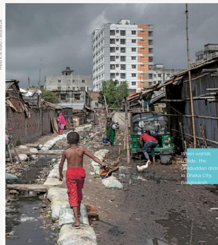
When worlds collide: the Chaduddan district in Dhaka City, Bangladesh