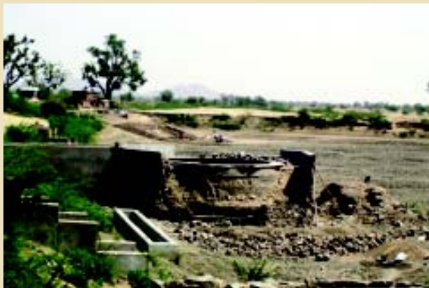
Farmers in Rajasthan reviving their traditional water storage systems

Though farmers are dealing with the climate change in their own way already, it is important to support them to prepare better to deal with the changing climatic conditions. Farmers need information, for example, on weather changes or access to drought or flood resistant seeds. There are many government services available, also locally, but often these cannot be accessed by farmers. Meteorological data for example, hardly ever reaches the farmers.