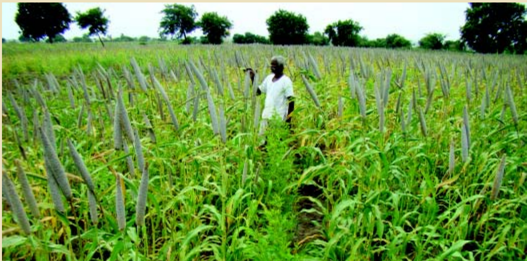
Farmers practice mixed cropping and millet growing to adapt to changing climatic conditions

Realising the importance of local situations also means that developed countries and institutions should not force small producers to shift from food crops to non food, commercial crops. Rather, the focus should be on local food production systems which are less carbon intensive, on integrating decentralized systems of production, processing and distribution of food and relying on local resources and knowledge.