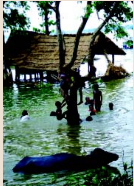
Floods are becoming more common in Northern India.

People should be involved in all the development processes, not just in disaster preparedness.