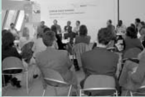
German Regional Consultation Berlin, Germany October 2006