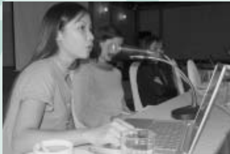
Asian Regional Consultation Chiang Mai, Thailand May 2006