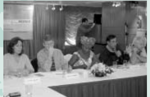
EcoFair Trade Dialogue panel discussion Hong Kong December 2005