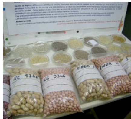
Seed – ready to be sown in field trials. The international crop research institute ICRISAT in Niger carries out participative research on agriculture in the semi-arid tropics.

denly, Africa's agricultural resources are of interest to development policy, private capital and the governments of emerging economies concerned about feeding their people. In view of rising demand and soil degradation, many regions are now encountering limits to further production gains from the expansion of cultivated land alone. An intensification of production – an increase in productivity per hectare – has become inevitable, and could also be profitable. The question, however, is whether the vast majority of resource-poorer African smallholders are able to make this happen, or just the better-positioned farm enterprises?