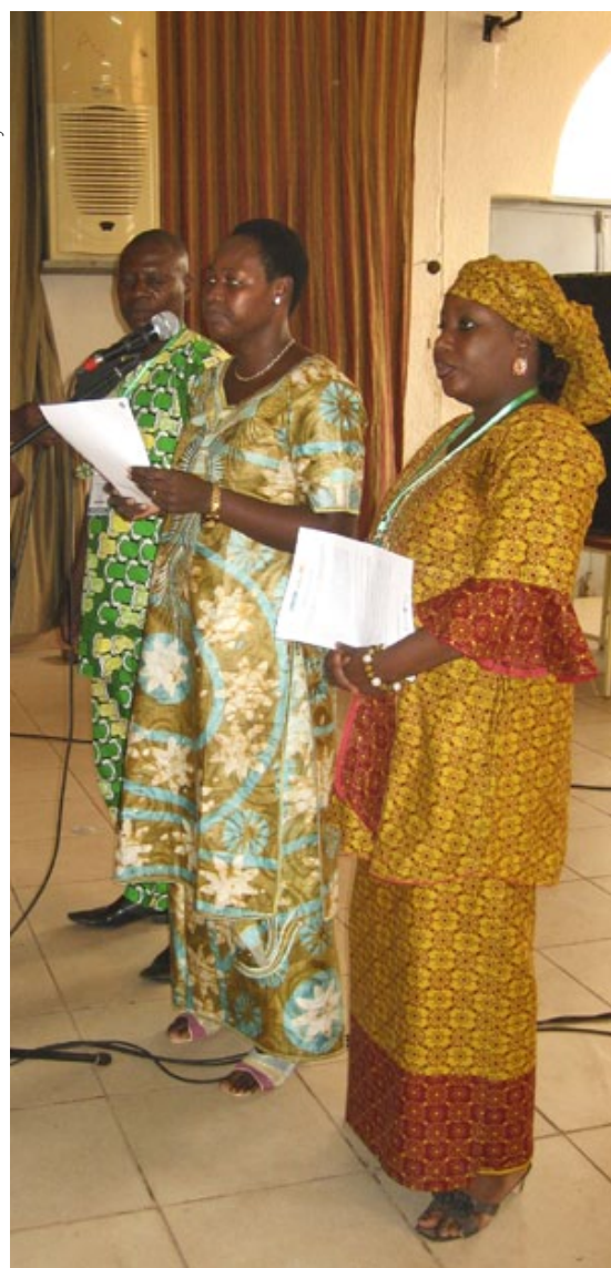
Farmer representatives read out the Ouagadougou Declaration on farmer-led research.