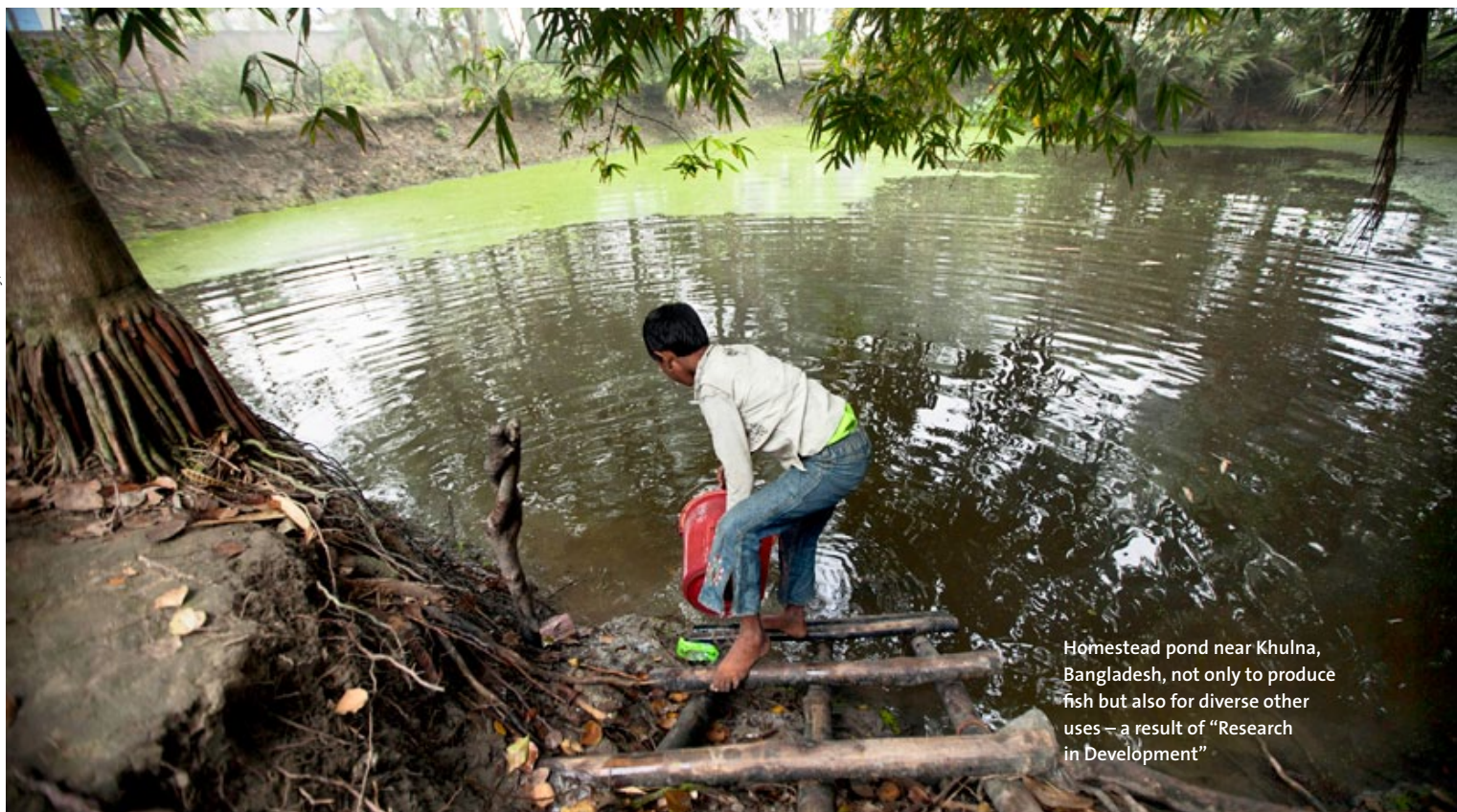
Homestead pond near Khulna, Bangladesh, not only to produce fish but also for diverse other uses – a result of “Research in Development”