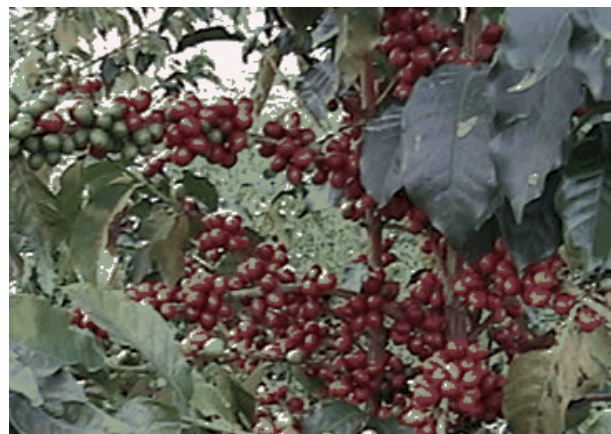
Coffee beans ready for harvesting

Organised associations of small farmers are starting to make ever more insistent demands for changes in national and international agriculture policies. With the formulation of the term food sovereignty, they have developed the concept of the right to nutritional food and demand the basic structure and conditions that will not only allow for small-scale sustainable farming and the prioritisation of local food security and marketing, but also protect this system against global