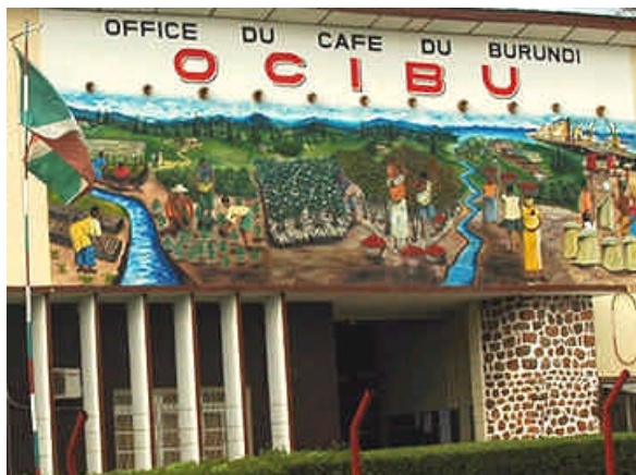
The government-run coffee authority responsible for Burundi's coffee policy

Since the mid-1990s, INADES Formation in Burundi has been supporting coffee farmers in their continuing process of self-organisation. Whereas to all intents and purposes coffee-farming families within the state-controlled coffee production system had the status of dependent 'wage labourers', the establishment of farmers' organisations helped local organisations make the bottom-up transition to self-administration in progressive stages. Widespread organisation among coffee farmers meant that pressure could be exerted on the marketing board and a higher price for the producers negotiated. Today, these organised coffee farmers are actively campaigning so that within the framework of privatisation, they too can gain ownership of the coffee processing plants which are currently still in state ownership