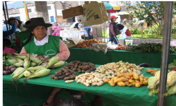
Market in Abancay, Peru

The provision of adequate basic conditions to ensure the material basis for small-scale producers is not in itself sufficient to procure rights for the 'poor of the people', and to promote socially just development.