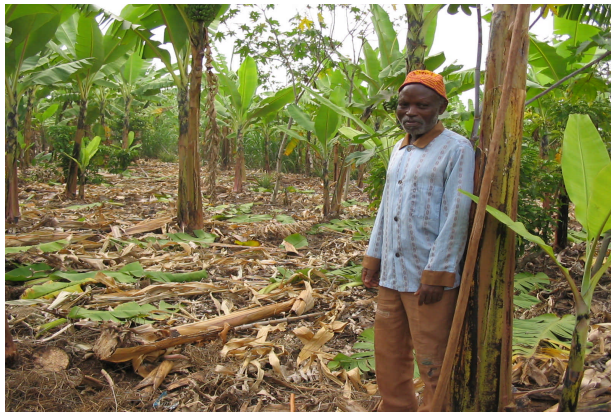
A smallholder farmer in his sustainably run banana plantation

For around 10 years now, MISEREOR has supported partner organisations in Uganda in the provision of agricultural extension services. xi Due to prevailing natural conditions, environmentally oriented agriculture fits in well with existing production systems. Using improved, sustainable cultivation methods, small farmers can substantially increase both their food security and their cash income from agriculture. The results of an impact study carried out in 2005 bear this out. When compared to a control group with the same initial conditions, farming families advised by seven extension projects came off better at all levels. xii The cropping systems developed for growing food and cash crops are highly diversified. The vulnerability of these farm enterprises to crop losses due to weather conditions and to falling prices for market produce is reduced to a minimum. In addition, a variety of markets are supplied (local, regional, and global), which also reduces risk.