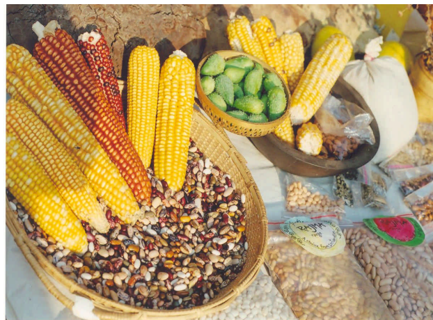
Traditional varieties of maize

So that the Creation entrusted to our stewardship as human beings is preserved for the future and for our children and our children's children, a rapid rethink and a global change in the way we use resources and shape the landscape is essential. In this connection, basic conditions must be oriented towards ecological sustainability and social justice, that is to say for the benefit of the disadvantaged.