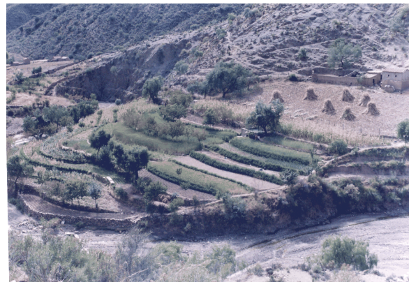
A panorama view of the plots of land belonging to Don Gregorio (ACLO)

For the most part, local markets—provided that they are not controlled by trading oligopolies or even monopolies—offer favourable conditions for efficient marketing of a variety of produce, thus making an important contribution to supplying local demand for food. In addition, refining and processing agricultural produce are activities which provide promising opportunities for local value creation. If such products are also consumed locally, thereby strengthening the local economic cycle, locally generated profits will be available for further investment in the local economy.