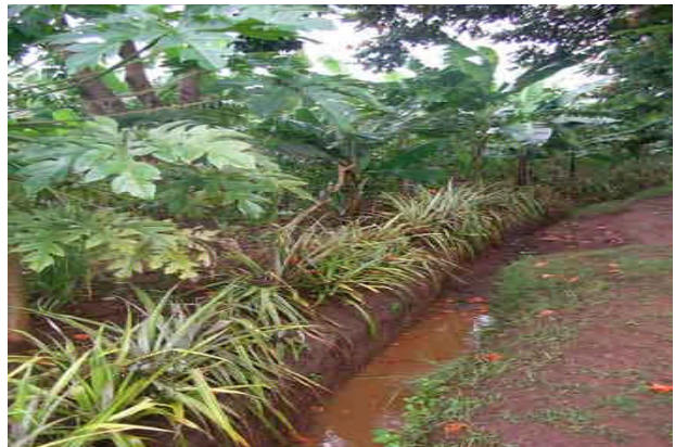
A water infiltration ditch to catch the rain water

Uganda is just one example among many in the agricultural sector. Since the mid-1980s, MISEREOR has exclusively promoted and supported small-scale sustainable agricultural production systems, but without favouring any single specific approach, such as 'low external input sustainable agriculture' (LEISA), or organic agriculture. Farmers themselves choose which specific approach they like to follow.