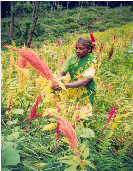
A farmer harvesting amaranth

MISEREOR supports ADS (Academy for Development Science) in its targeted facilitation of farmers' associations and small development organisations throughout India in the documentation and further dissemination of traditional land-use systems. Indigenous groups in marginal areas in particular use a broad range of cultivated plants and animals, as well as 'wild' flora and fauna, for their food security and to earn income. Such diversified systems are highly productive and sustainable, as they make use of environmental cycles, rather than destroying them. As an example, comparative economic studies have shown that the productivity of diversified farms cultivating a range of around 14 different varieties of grain, pulses, and vegetables surpasses that of rice growers. They produce larger amounts, have fewer outlays and generate more income.