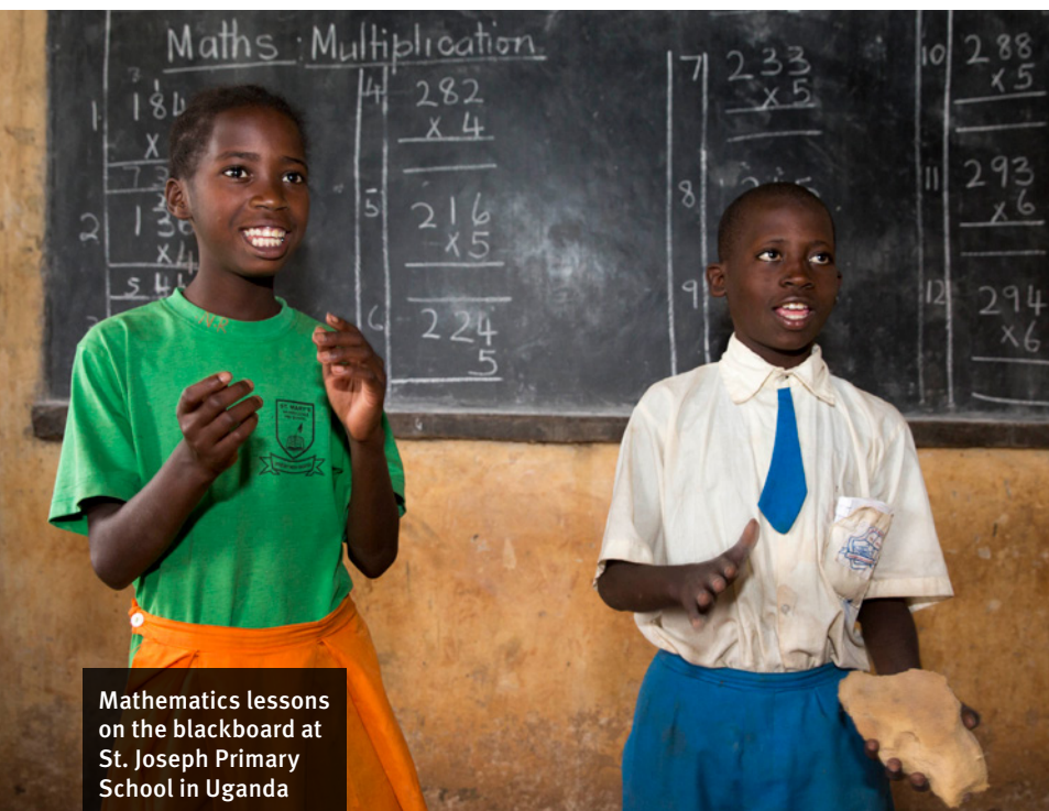
Mathematics lessons on the blackboard at St. Joseph Primary School in Uganda

▶ to strive for a targeted integration of the Church’s expertise and resources and for constructive cooperation with the Church and distribution of tasks in countries where Church structures play an important role in the education sector, such as in the Democratic Republic of Congo, Cameroon and Rwanda.