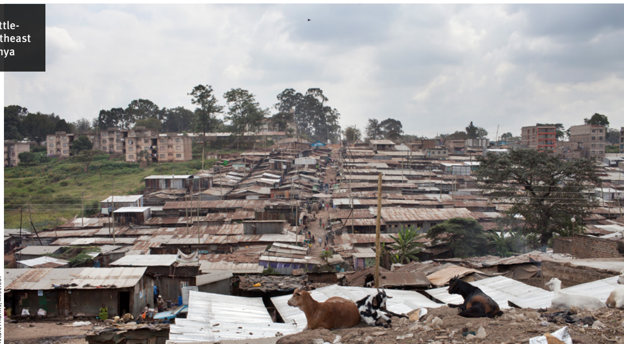
Mathare settlement in northeast Nairobi, Kenya

▶ to integrate the experiences and voices of religious actors and civil society groups, in particular young people and women, and to place their own, sometimes traditional peace and security concepts in the respective African country context at the heart of all planning of measures.