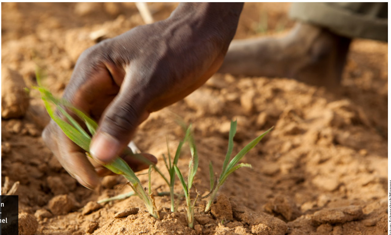
Cultivation in the drought- stricken Sahel in Niger

▶ to support multilateral organisations and mechanisms that can contribute substantially to global good governance (international justice, United Nations Human Rights Council, etc.).