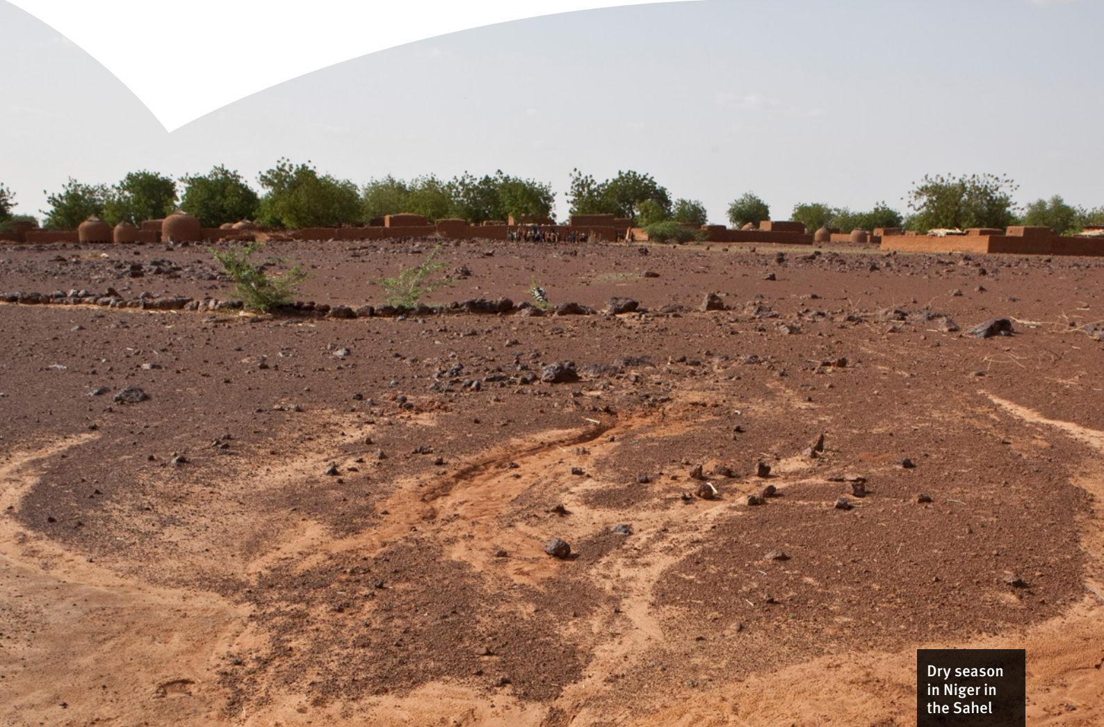
Dry season in Niger in the Sahel