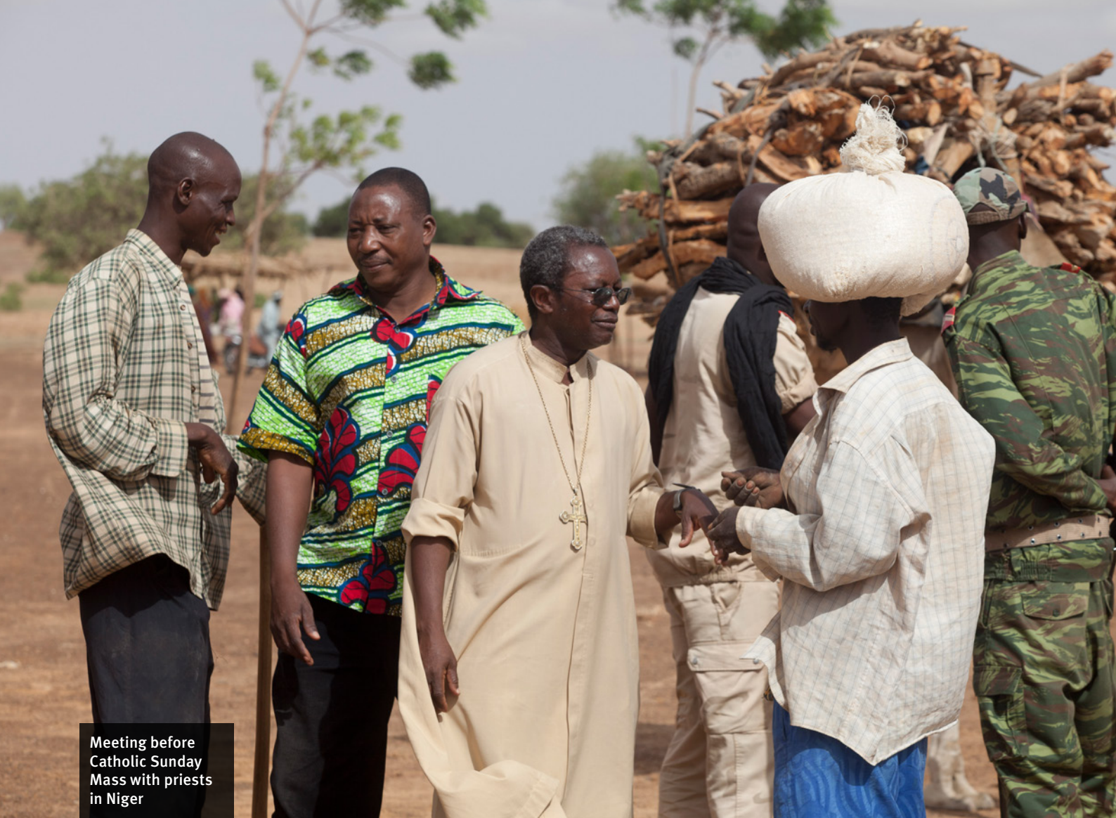
Meeting before Catholic Sunday Mass with priests in Niger