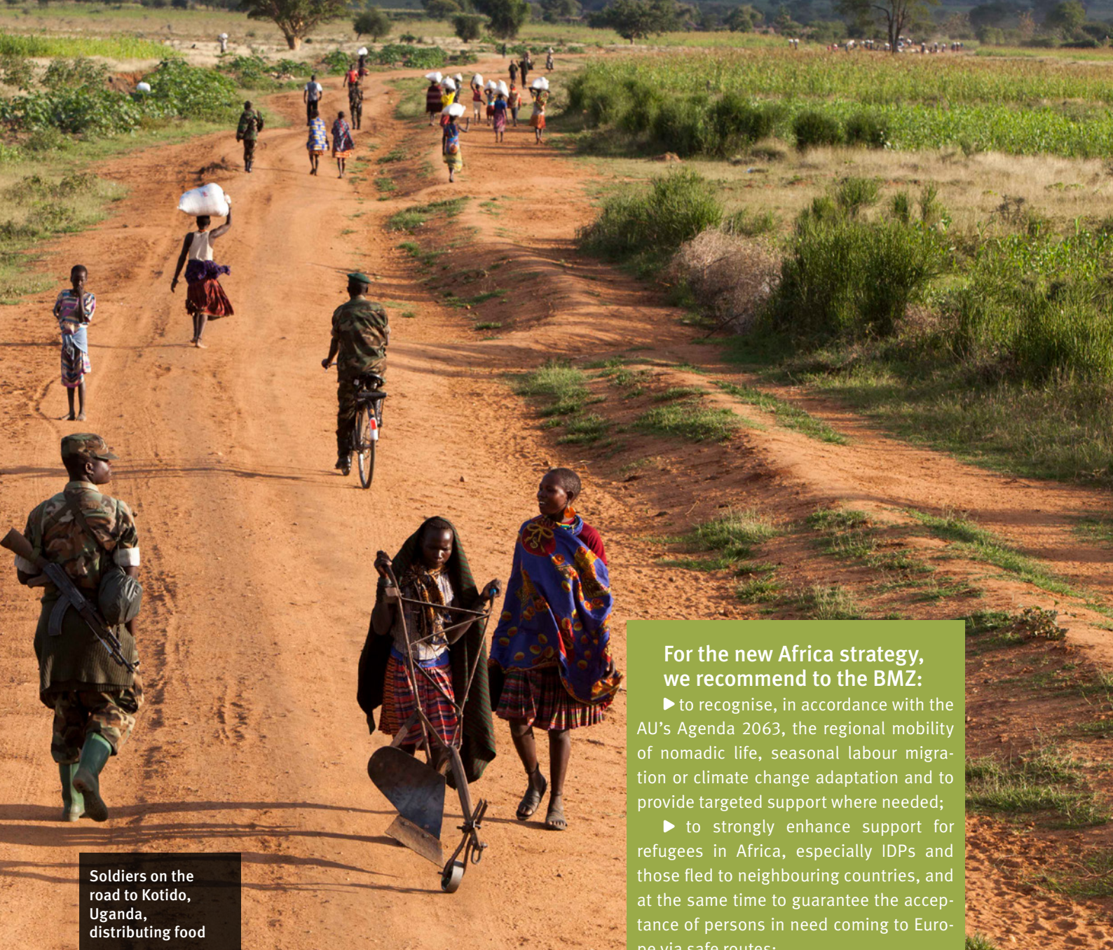
Soldiers on the road to Kotido, Uganda, distributing food