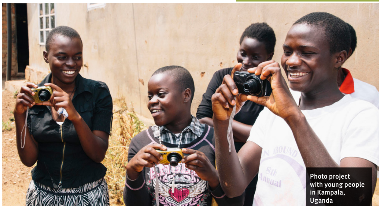
Photo project with young people in Kampala, Uganda