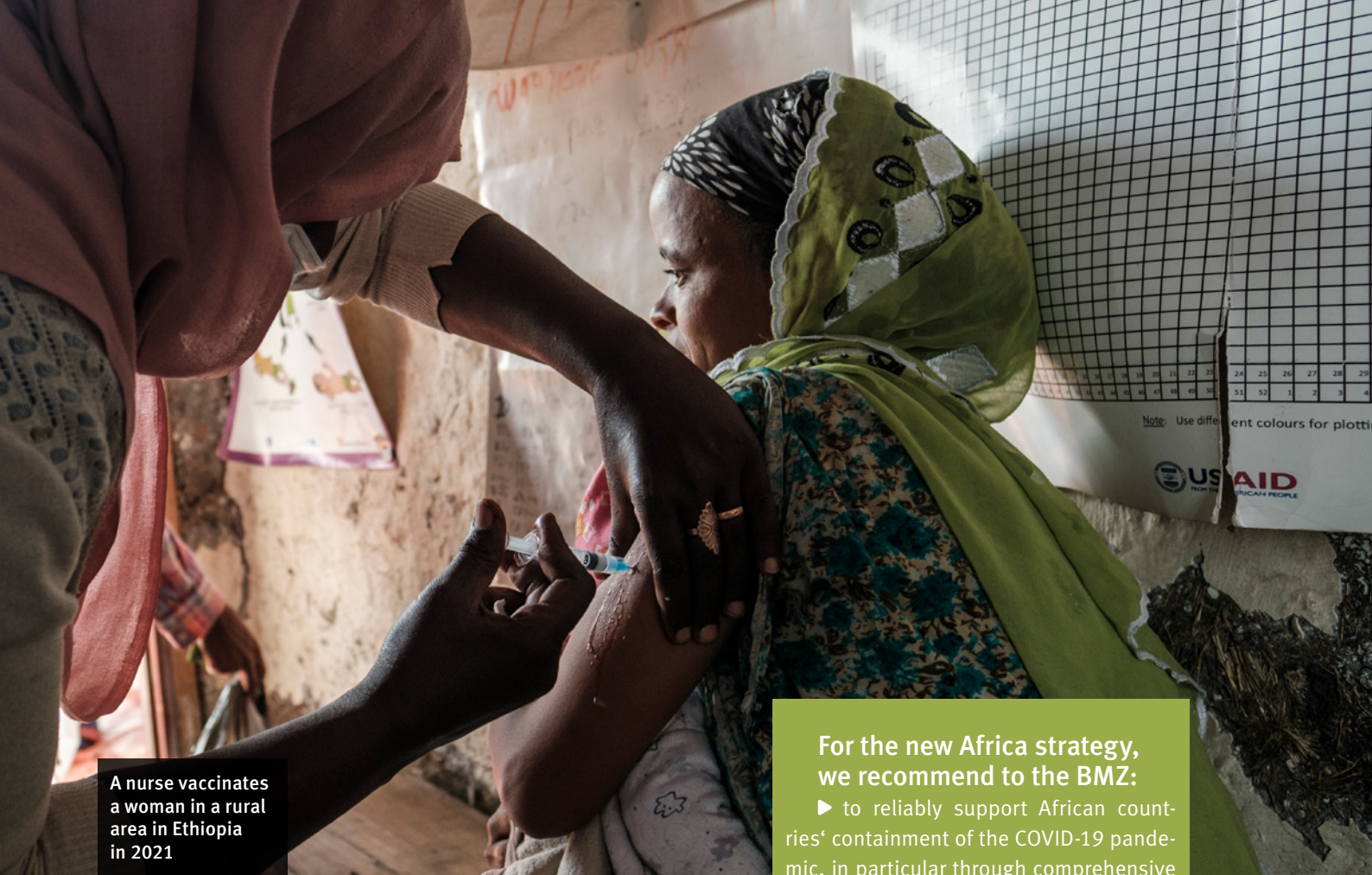
A nurse vaccinates a woman in a rural area in Ethiopia in 2021

For the new Africa strategy, we recommend to the BMZ: ▶ to reliably support African countries' containment of the COVID-19 pandemic, in particular through comprehensive access to diagnostics, medicines and vaccines against COVID-19 and support for appropriate local treatment programmes; ▶ to ensure equitable access to diagnostics, vaccines and medicines for all diseases in Africa in a multilateral context and to provide adequate funding; ▶ to promote the development and expansion of pharmaceutical production capacities and market access as well as technology transfer, especially of mRNA technology to Africa, e.g. to the WHO mRNA Technology and Transfer Hub in South Africa; ▶ to prioritise local health structures to achieve people-centred, grassroots (preventive) health care in the sense of Primary Health Care, while also integrating the experience of Church health systems; ▶ to incorporate One Health holistically, inclusively and cross-sectorally in multi- and bilateral cooperation with Africa to effectively prevent diseases caused, for example, by intensive land use and the displacement of people and animals from their natural habitats.