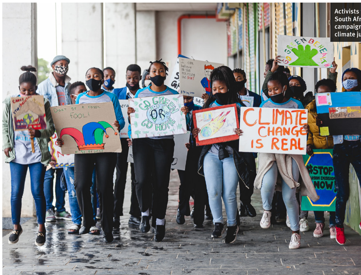
Activists from South Africa campaign for climate justice