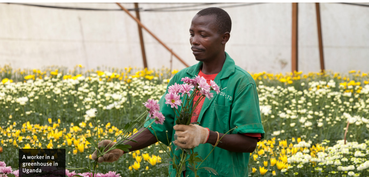
A worker in a greenhouse in Uganda