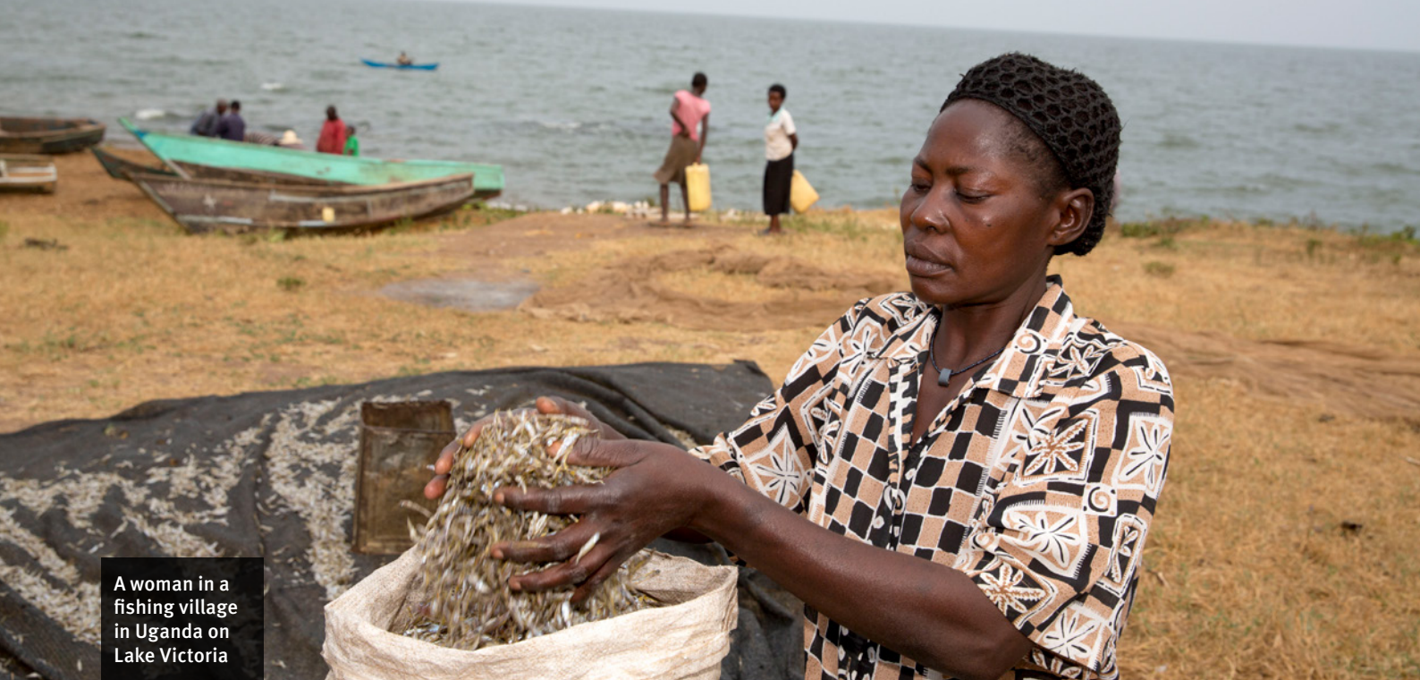
A woman in a fishing village in Uganda on Lake Victoria