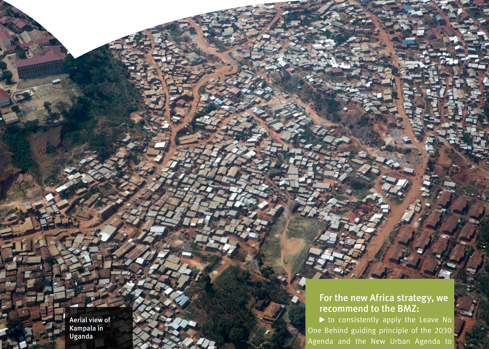
Aerial view of Kampala in Uganda