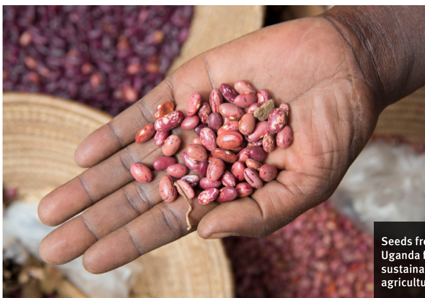
Seeds from Uganda for sustainable agriculture