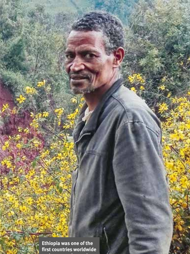
Ethiopia was one of the first countries worldwide to draw up sui generis legislation on the rights of communities, peasants and breeders