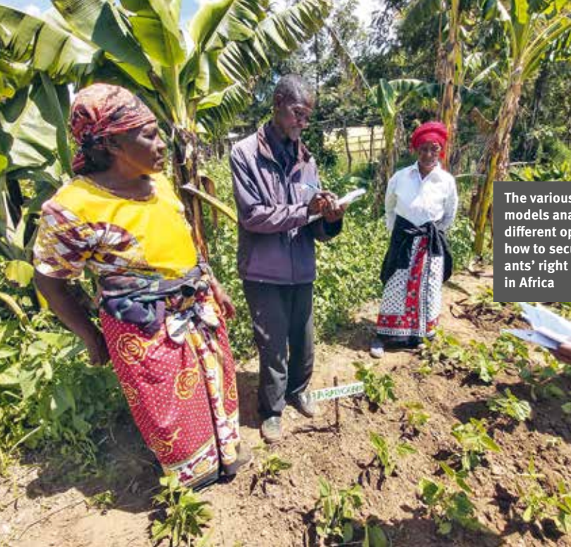
The various legislative models analysed offer different options as to how to secure peasants' right to seeds in Africa