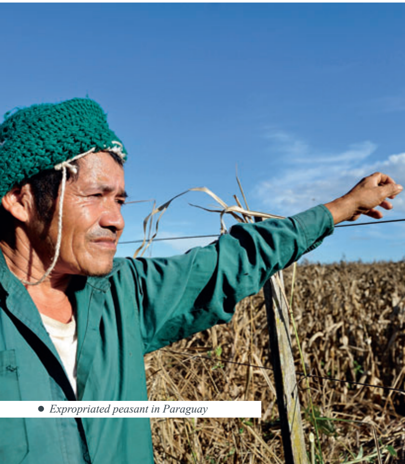
● Expropriated peasant in Paraguay

major Western transnational corporations often invest in land for agricultural use. 14 European and North American agricultural corporations secure land predominantly to grow crops such as corn, sugar cane and oleiferous plants for energy production. 15 There are countless globally active companies operating in the field of extractive production of raw materials like coal or precious metal mining. 16 These companies develop and operate mines