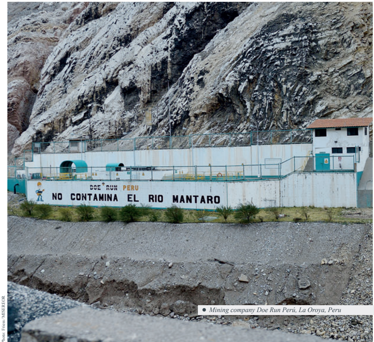
● Mining company Doe Run Perú, La Oroya, Peru