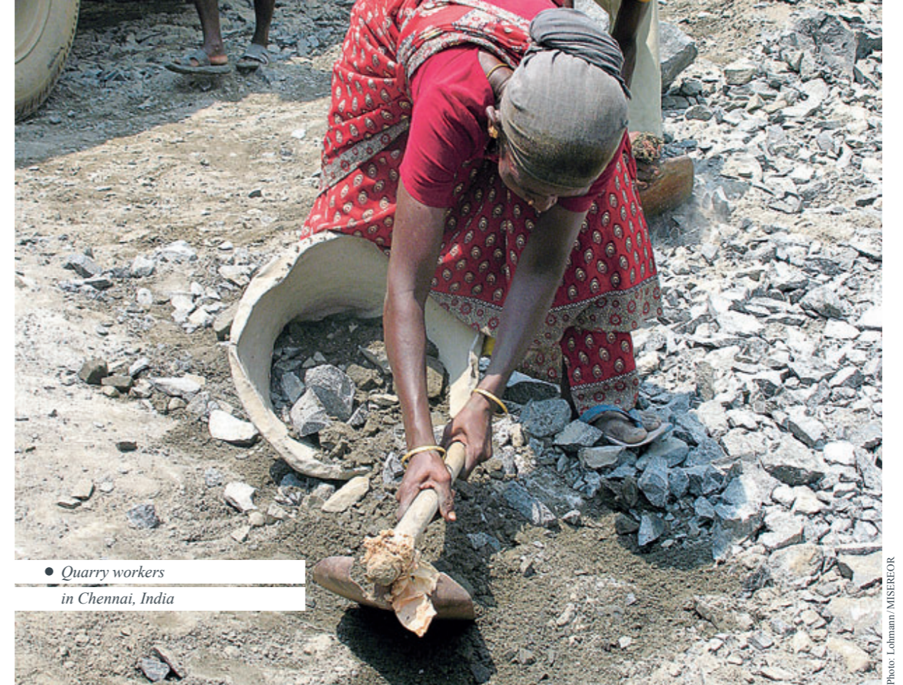
● Quarry workers in Chennai, India