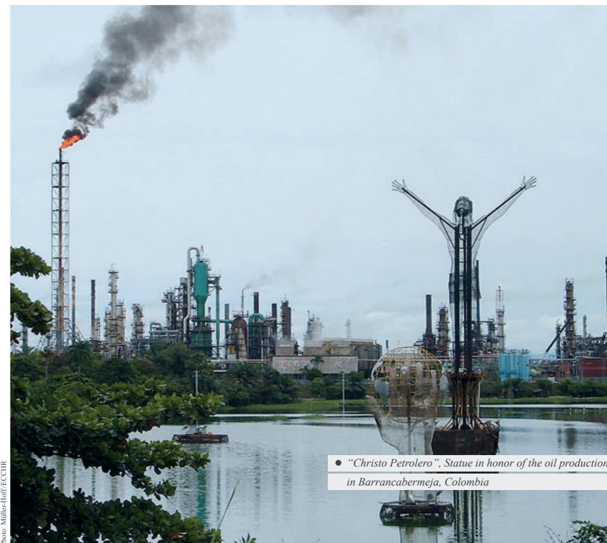
● “Christo Petrolero”, Statue in honor of the oil production in Barrancabermeja, Colombia