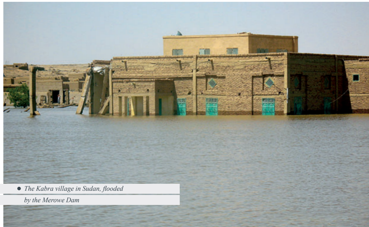
● The Kabra village in Sudan, flooded by the Merowe Dam