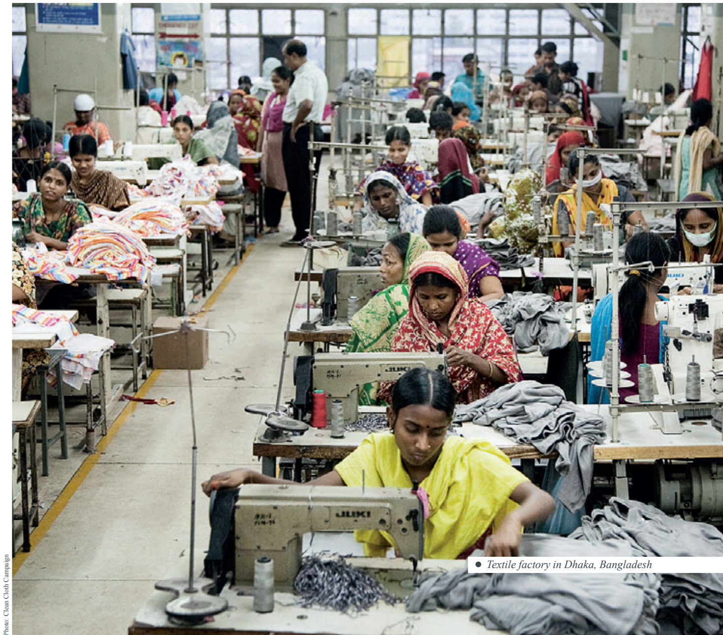
• Textile factory in Dhaka, Bangladesh

due diligence obligations for parent companies to prevent human rights violations in subsidiary companies. Both criminal and civil law provides for due diligence obligations such as the duty to implement safety measures and organisational obligations. These can be interpreted to mean that companies must control and direct foreign subsidiaries in their management of human rights risks. 46 The criminal complaints against the Nestlé managers and those in the Danzer case are thus based on the argument that the managers of the company in question were in breach of their duties and thus failed to exercise the due diligence expected of them. 47 In Britain, several claims for compensation have also been based on this legal argument. 48 British appeal courts held that parent com-