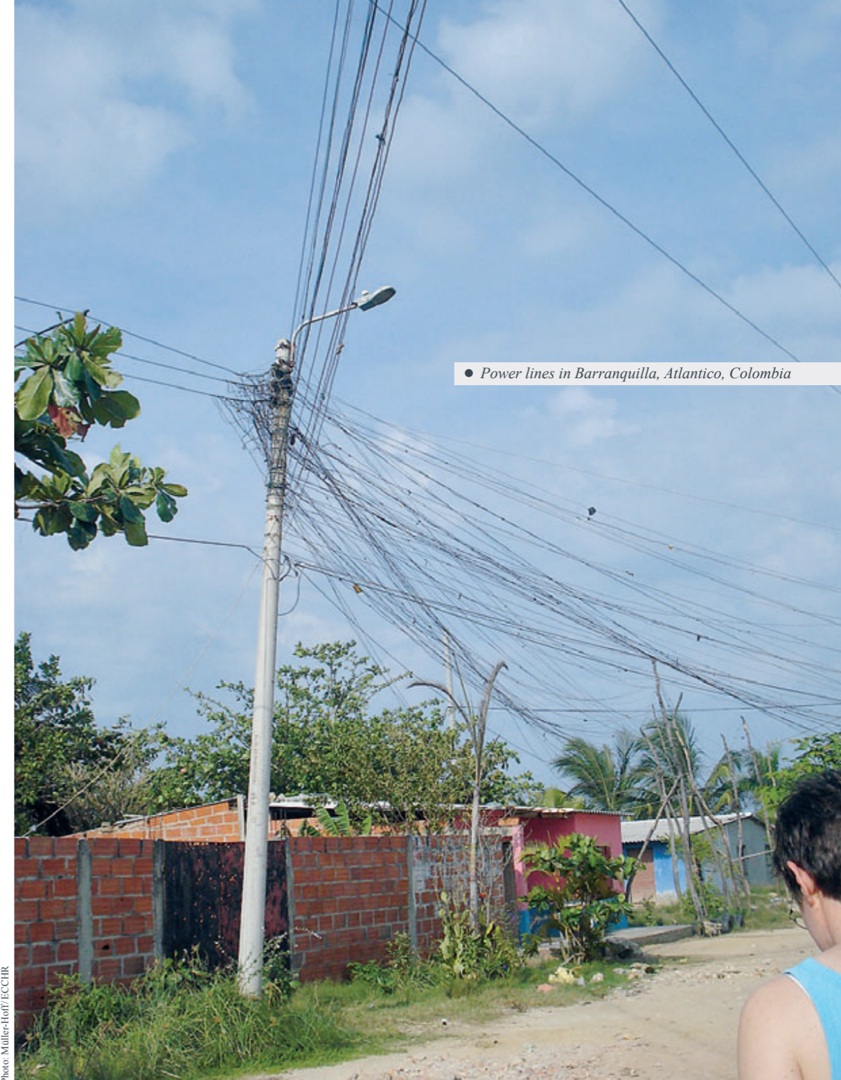
● Power lines in Barranquilla, Atlantico, Colombia

One of the basic legal standards of German corporate law is the corporate veil doctrine, according to which separate legal entities such as parent and subsidiary companies are liable only for their own infringements. Thus a parent company is, in principle, not liable for the obligations